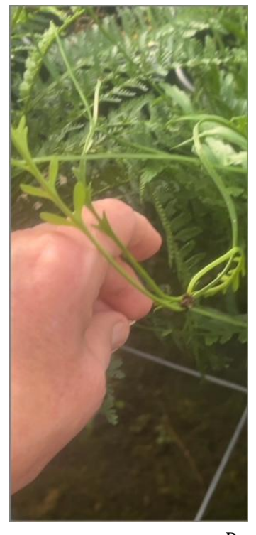
Page 5 of 7